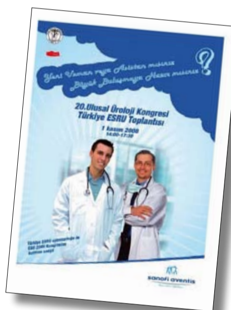
Figure 3: The poster showing the activity of Turkey ESRU for Turkish urology residents in the National Urology Congress