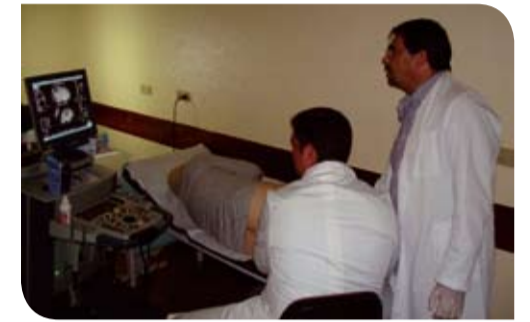
Each trainee performed two transrectal prostate ultrasound scans and three biopsies.

We hope that the next edition, the 10 th Prostate Ultrasound and Biopsy Course, which is scheduled on 29 and 30 April, will not only be open or attract mainly Portuguese residents but also young urologists from other European countries. For more information please email us at prostatecourse@gmail.com We hope to see you in Lisbon, Portugal!