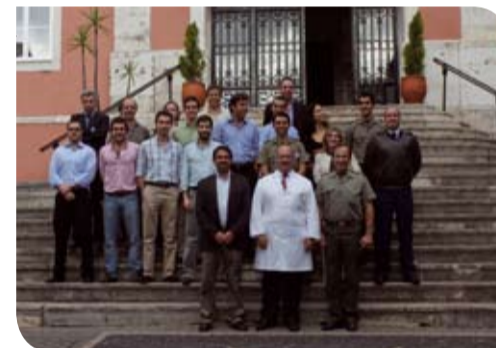
All participants and faculty gathered for a photo on the stairs of the main entrance of the Military Hospital.

With individualised mentoring, organising a course like this one certainly involves some complexity as the training programme demands extensive logistic and organisational capability, not only in selecting a large number of patients but also by making available to participants the latest ultrasound probe technology that can be found in the market.