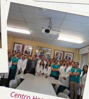
Centro Hospitalar e Universitário de Coimbra