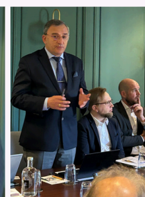
A Chkhotua - chairman Accreditation Committee