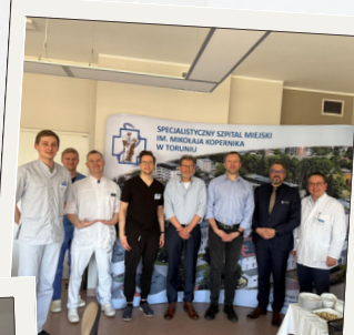
Specjalistyczny Szpital Miejski im. M. Kopernika

Meanwhile, the countdown has begun for the Part 2 FEBU Oral Exam 2025, set to take place on 21 June in Leuven, Belgium. Simultaneously, the exam will be taken in Warsaw, Budapest, and Istanbul. Starting from the end of May, candidates have the opportunity to take the Mock Case to become familiar with the exam format. We strongly encourage all candidates to take advantage of this valuable resource. We look forward to welcoming our candidates and examiners to one of the highlights of the EBU calendar - Part 2 FEBU Oral Exam!