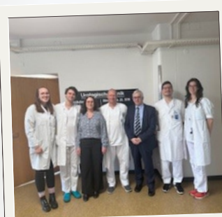
University Hospital of Bern