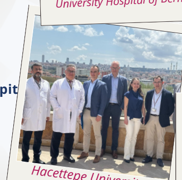
Hacettepe University School of Medicine