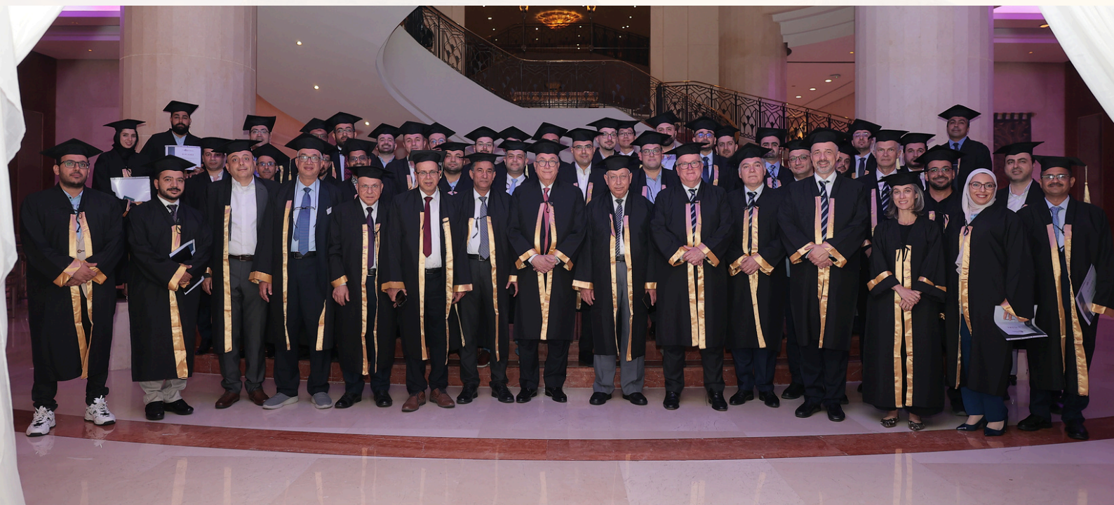
Participants and examiners of Part 2 FEBU International Oral Exam 2025 in Cairo, Egypt

On 3 May 2025, we were pleased to welcome 35 candidates from across the Middle East and beyond to Cairo, Egypt to sit the Part 2 FEBU International Oral Exam.