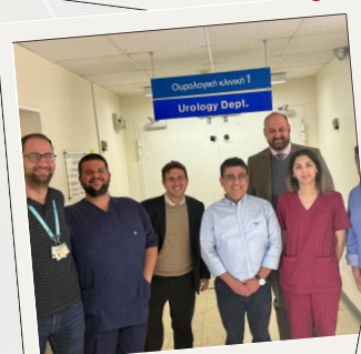
University General Hospital of Heraklion