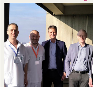
1st Faculty of Medicine, Charles University and General University Hospital