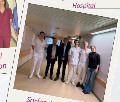
Sorlandet Sykehus HF Kristiansand